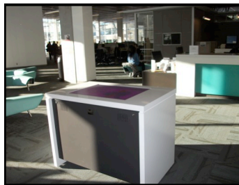
SMART touch tables