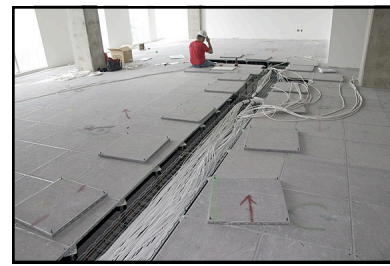
Installation of Cat6A cabling