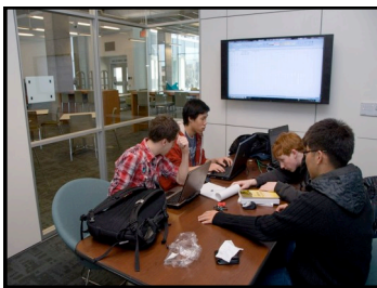
Collaborative student workrooms