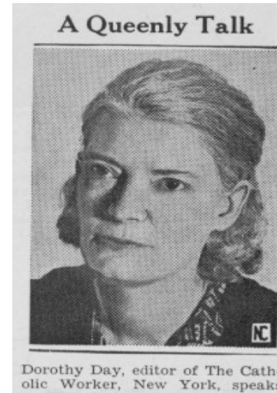
The Catholic World in Pictures, 13 April 1940