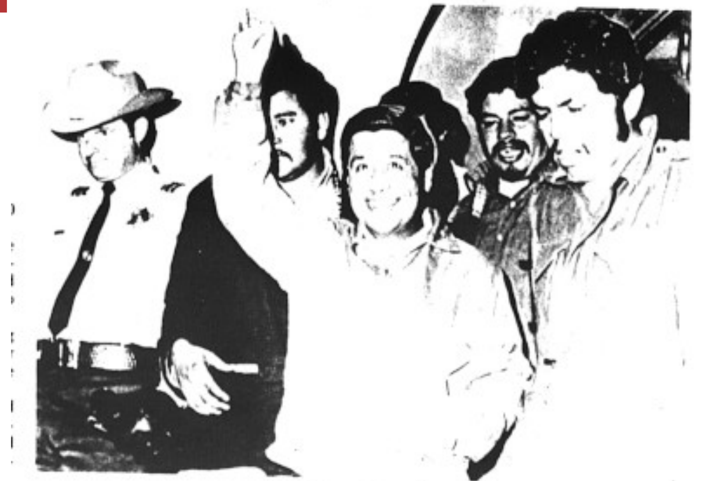
FREE: Cesar Chavez leaves Monterey county jail. Chavez: 'Jails like farms'

Special to the National Catholic Reporter SALINAS, Calif. — Empowerment from jail