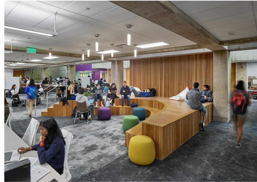
Sorrells Engineering and Science Library

Management strategies for data that can be used for outreach and educational purposes.