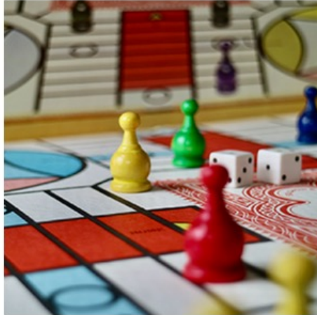
Exhibit Opening: Game On! Design and Play for a Sustainable Future