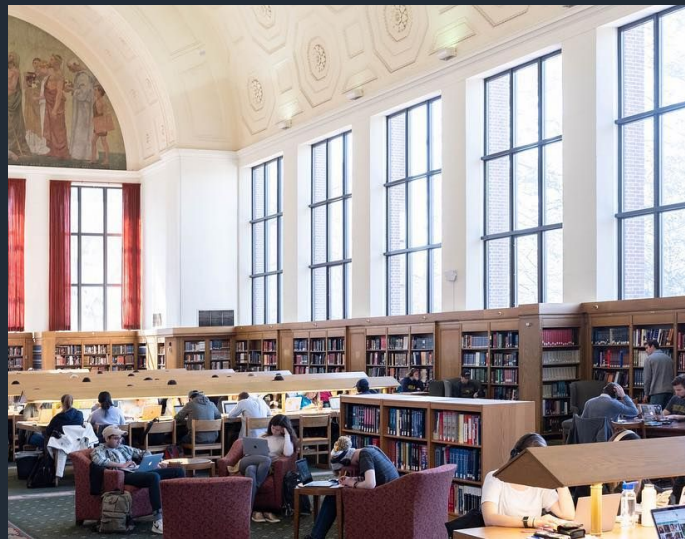
Obligatory studios image of campus

Shared values and principles guiding our work.