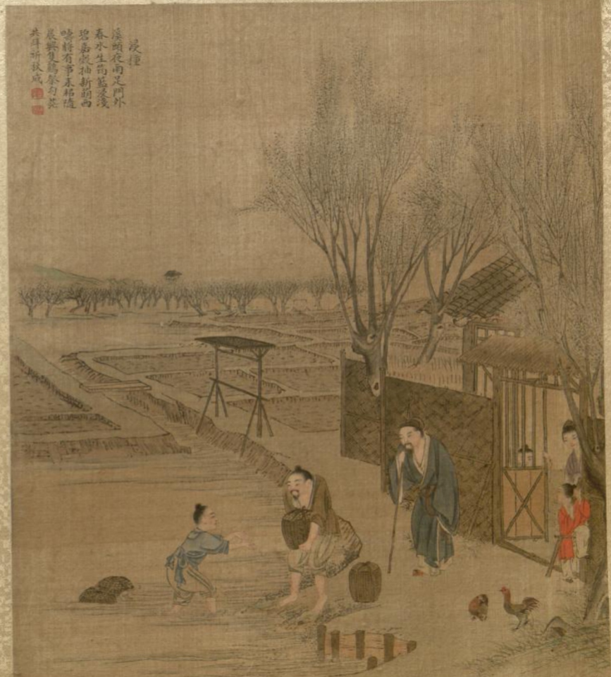
Jiao, Bingzhen & Kangxi, Emperor of China, et al. (1696). Pictures of Tilling and Weaving. https://lccn.loc.gov/2012402859