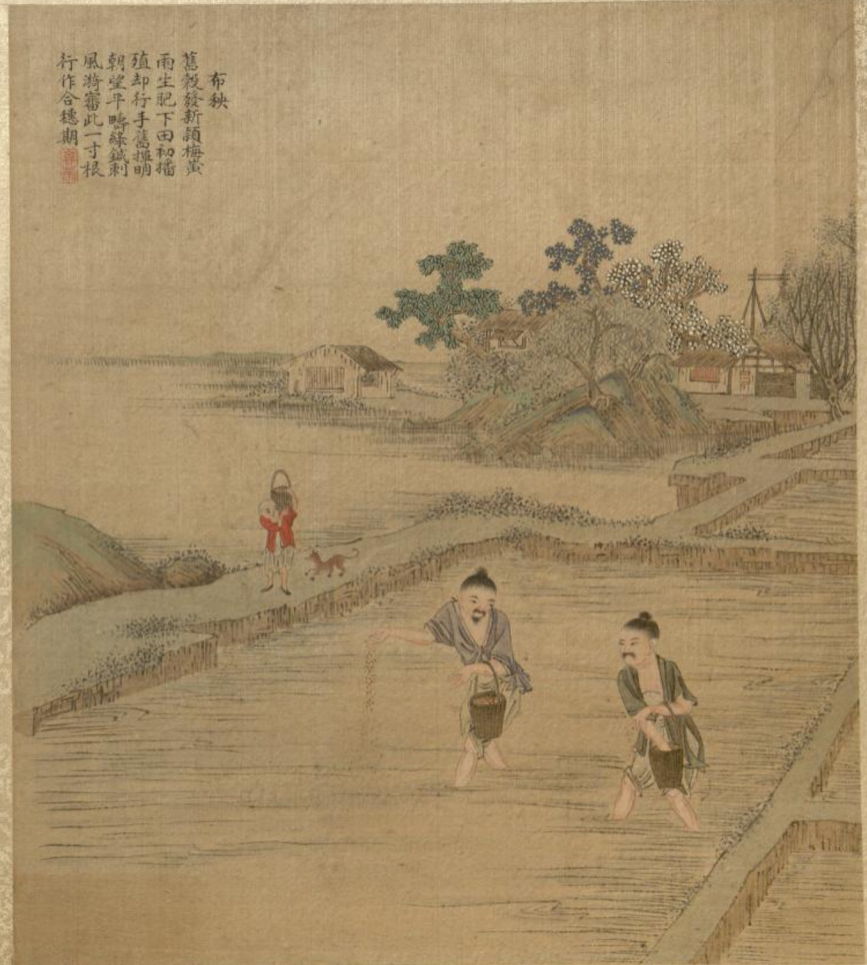
Jiao, Bingzhen & Kangxi, Emperor of China, et al. (1696). Pictures of Tilling and Weaving. https://lcn.loc.gov/2012402859